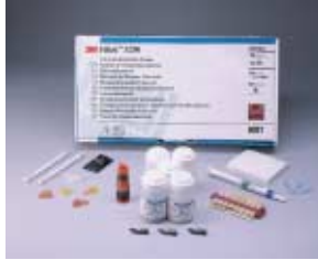
6021 - Filtek™ Z250 Universal Restorative System Capsule Introductory Kit

The lowest polymerization shrinkage, as shown in Chart 1, is only the beginning. With its high performance, strength, and easy handling, this micro-hybrid restorative fills a variety of needs—with beautiful results.