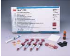
6020 - Filtek™ Z250 Universal Restorative System Syringe Introductory Kit